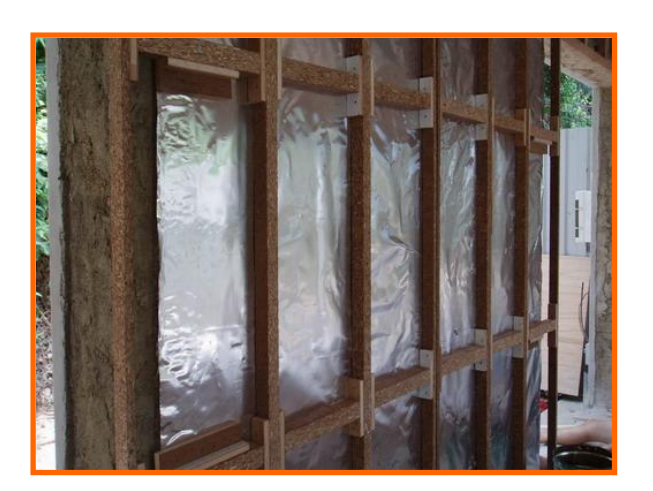
Illustration: Polynum installed in masonry walls: