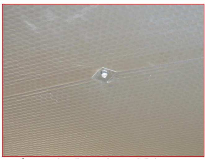
Screw and washer used to attach Polynum to metal frame