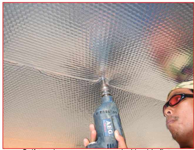
Self-tapping screws are used with wide flat washers